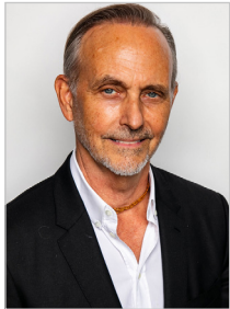
Jpeg 1MB ↓