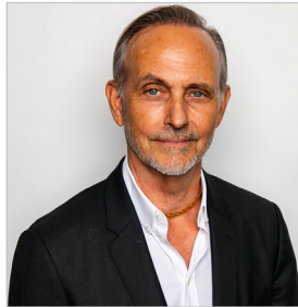
Jpeg 1.2MB ↓