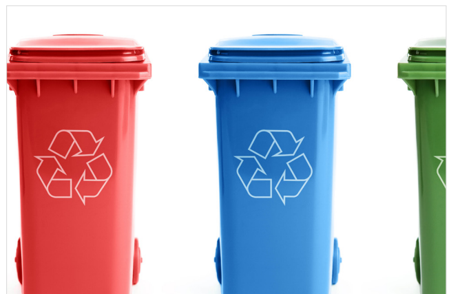
“ICOs Dead? Long Live STOs!”