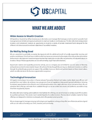
'About Us' 1.1MB ↓