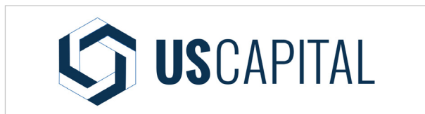
Print resolution Jpeg 1.4MB ↓