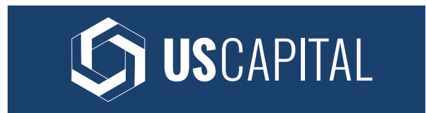
Print resolution Jpeg 1.4MB ↓